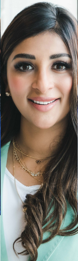
Dr. KIRAN BEDI