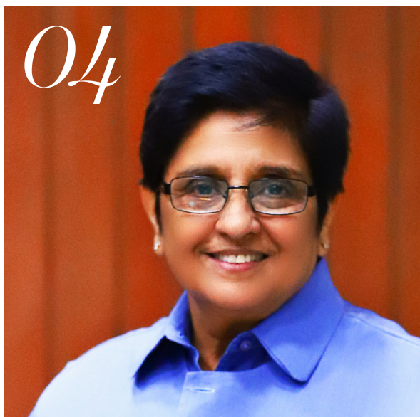
Dr. KIRAN BEDI A National Icon!