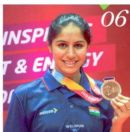
MANASI JOSHI Indian para-badminton player